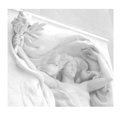
About the Images:

Cover and elsewhere: Mourning Victory by Daniel Chester French. Used with French merged innovative technique and permission. symbolic content in Mourning Victory, as he called the figure of the angel. She emerges from what reveals itself as a unknown cavity, flesh from stone as light from the darkness. The partial nude strides forward with hair and drapery swirling around her. The tip of a wing is visible near her knee. In one outstretched hand she holds a branch of laurel, while in the other she lifts above her head an American flag, its stars decisively rendered. This charged physical movement maintains a carefully orchestrated emotional balance with the melancholy restraint of the angel's downcast eyes. Mourning Victory embodies success with sacrifice, proud but quiet triumph emerging from tragedy.